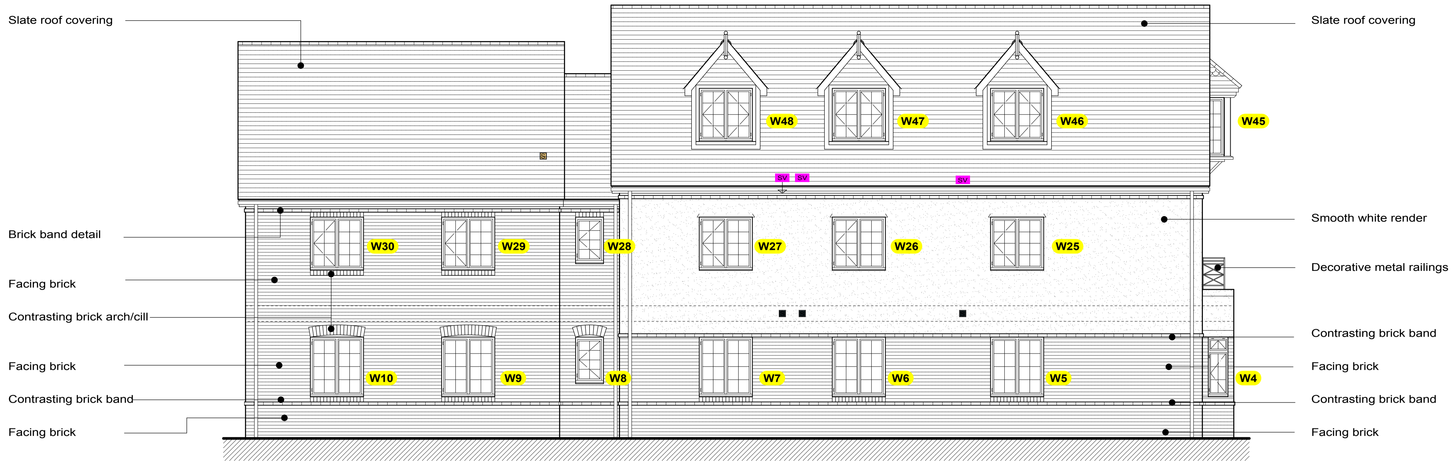
FRONT ELEVATION FACING UNDERWOOD DRIVE

NOTES: All dimensions must be checked on site and not scaled from this drawing.