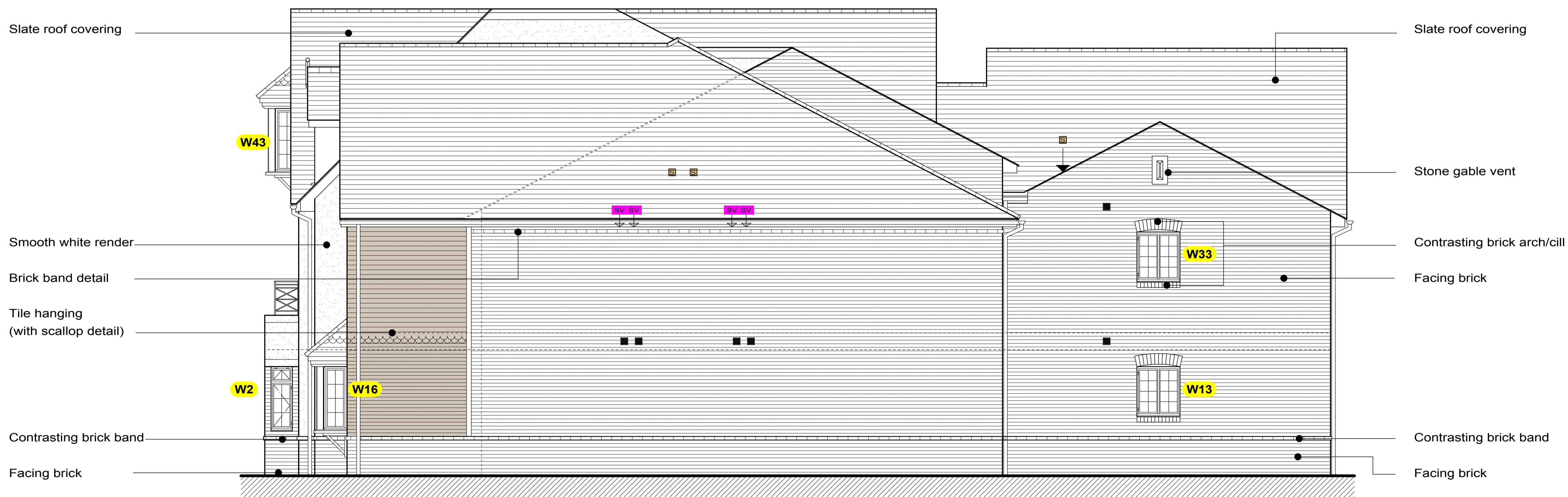
SIDE ELEVATION FACING LARKSPUR