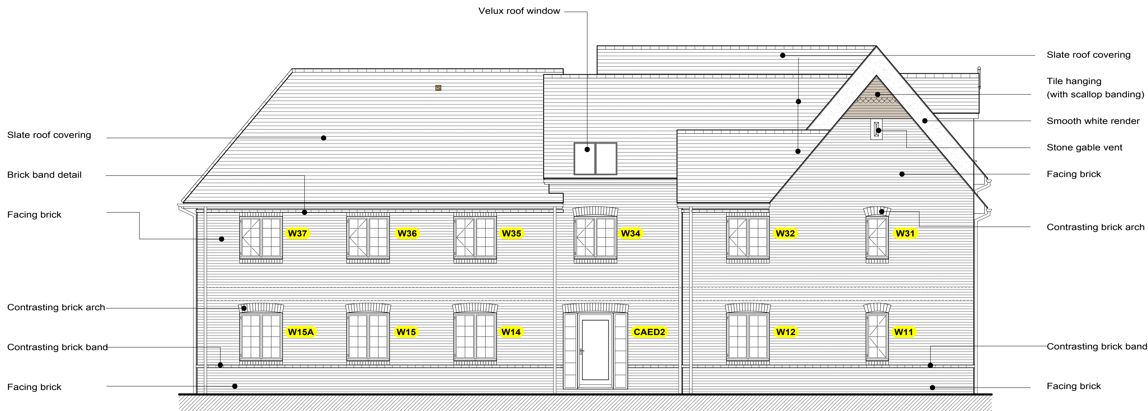
REAR ELEVATION FACING PARKING COURT