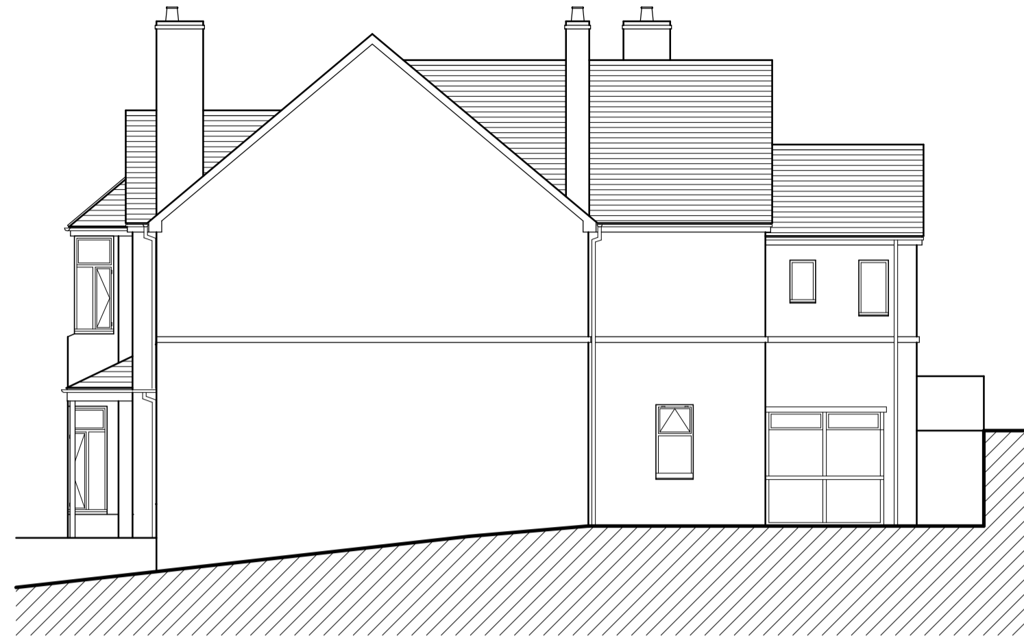
Side Elevation - East