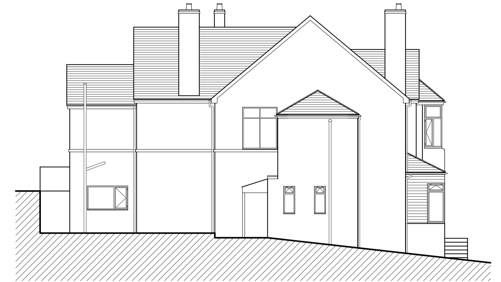
Side Elevation - West