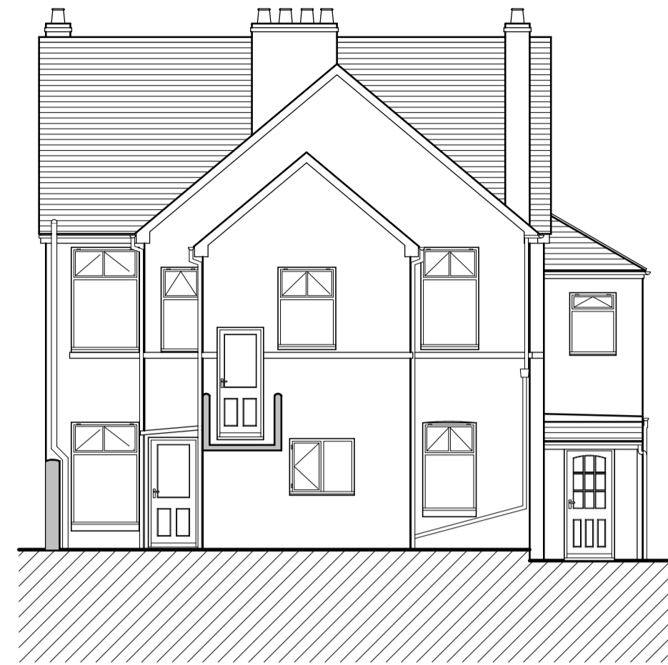
Front Elevation - North