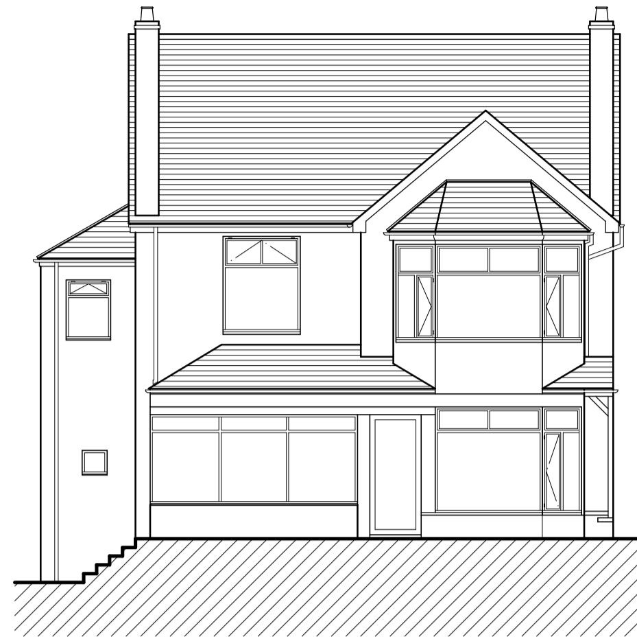
Rear Elevation - South

NOTES: All dimensions must be checked on site and not scaled from this drawing.