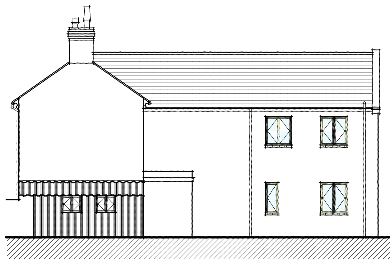
Front Elevation - North Existing Elevations - Scale 1:100

Notes: * This drawing is copyright. * All dimensions must be checked on site and not scaled from this drawing