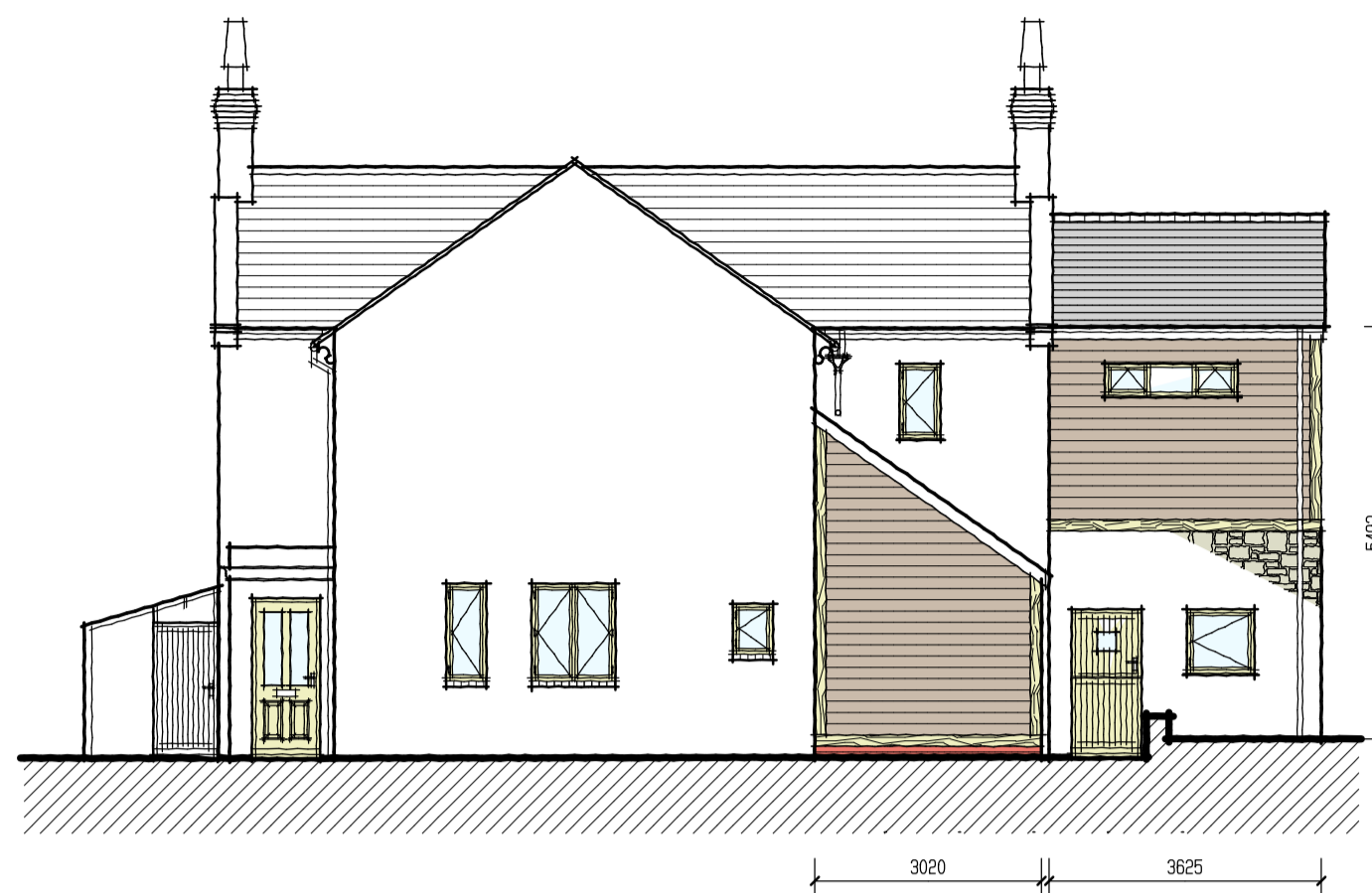
Side Elevation - West