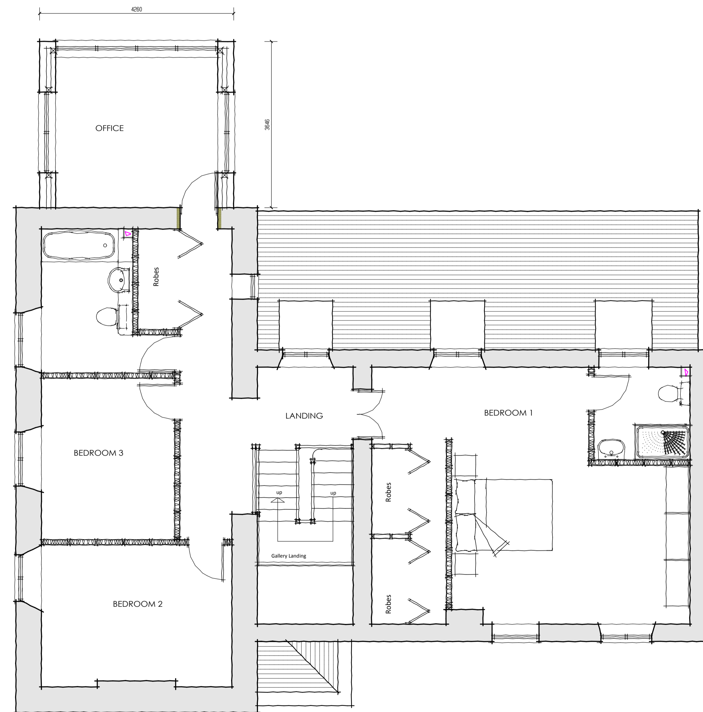
First Floor Layout - Scale 1:50