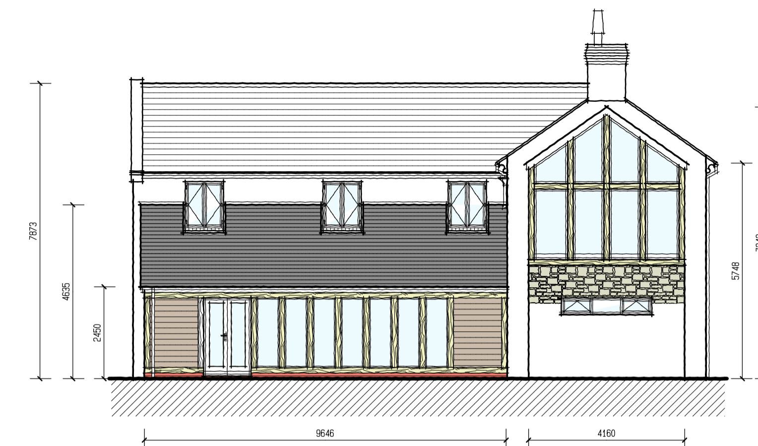
Rear Elevation - South