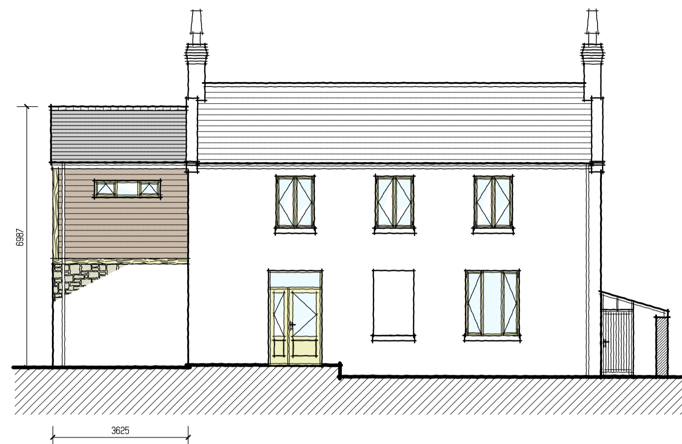
Side Elevation - East